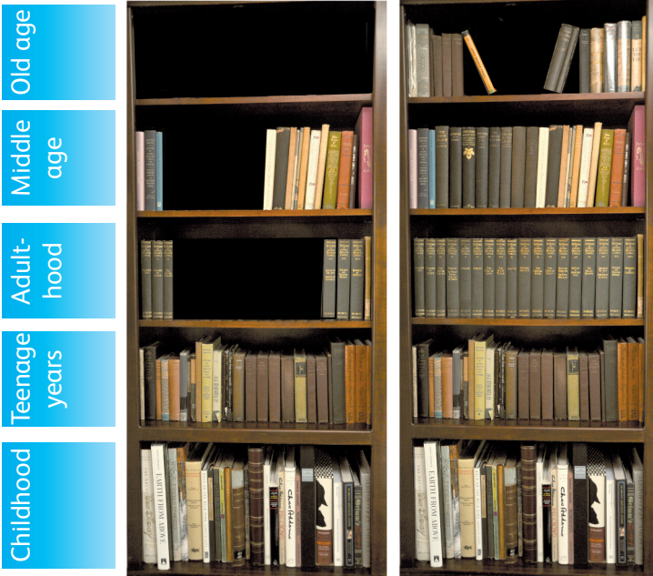
Middle stage dementia

Amygdala feelings and emotional memories