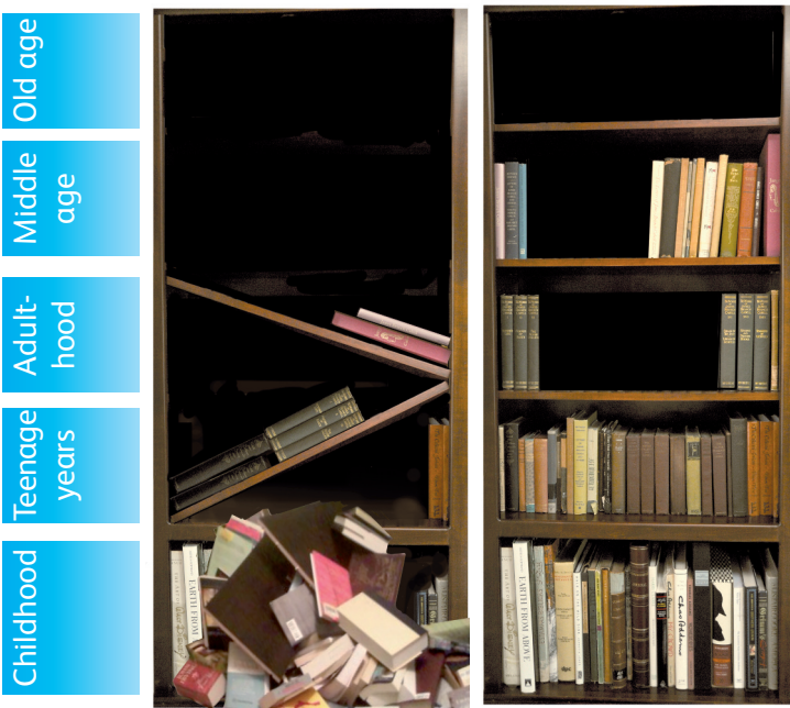
Late stage dementia

If factual information and the ability to use logic and reason are lost, it is much more difficult to find and make sense of the memories that remain.